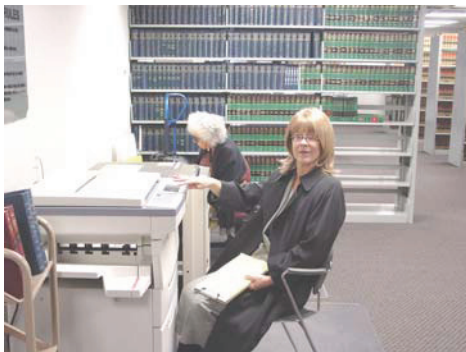
Copier in Law Library

Suggestions: Some type of notice might be provided so that persons with disabilities can alert court personnel to re-assign cases from one courtroom to another if better access is needed for a person with a disability who will be participating in a court proceeding.