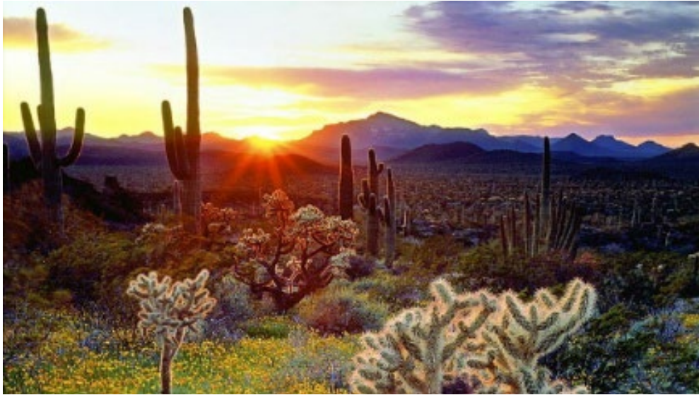
It's Spring in Arizona!